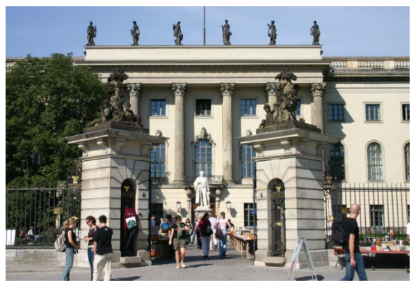
Humboldt-Universität, Unter den Linden

Many sightseeing spots, such as the Reichstag, the Brandenburg Gate, the Museum Island and the Gendarme Market are within walking distance to the venue.